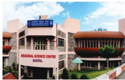
Regional Science Centre