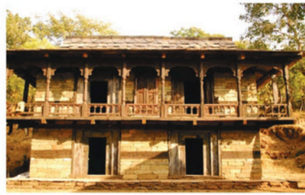
Rashtriya Manav Sangrahalaya