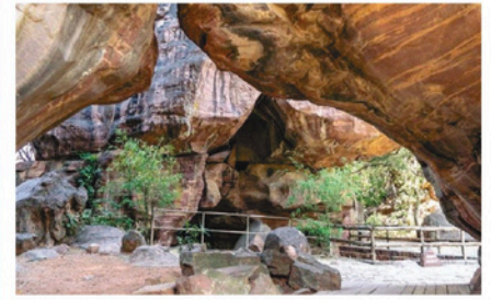
Bhimbetka Rock Shelters