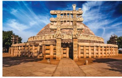
Sanchi Spota Bhojpur