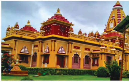
Lakshmi Narayan Mandir