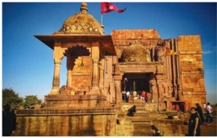
Bhojeshwar Mahadev Mandir