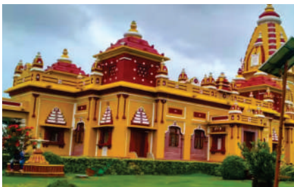
Lakshmi Narayan Mandir