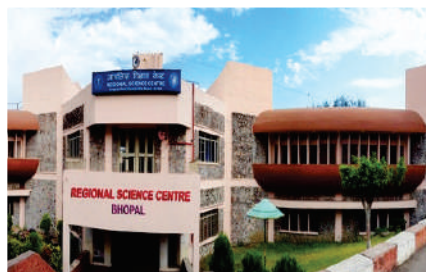
Regional Science Centre