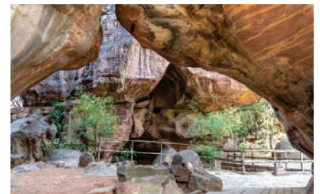
Bhimbetka Rock Shelters