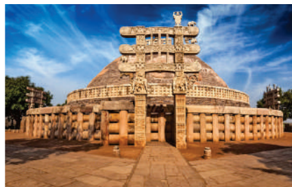
Sanchi Spota Bhojpur