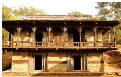
Rashtriya Manav Sangrahalaya