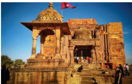
Bhojeshwar Mahadev Mandir