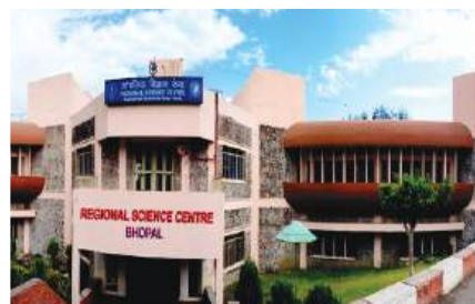
Regional Science Centre