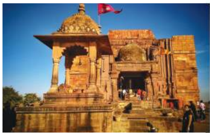
Bhojeshwar Mahadev Mandir