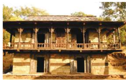
Rashtriya Manav Sangrahalaya