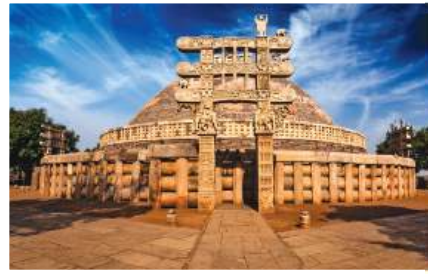
Sanchi Sputa Bhojpur