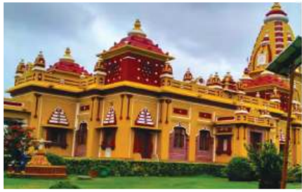
Lakshmi Narayan Mandir