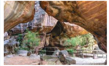
Bhimbetka Rock Shelters